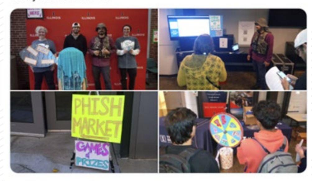
3:08 PM · Oct 26, 2022 · Twitter Web App

The Phish Market is still going on; we will be here until 4 pm with information, prizes, and much more. Come and join us at DCL.